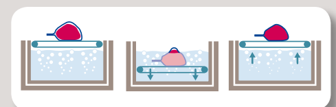
left side: ST 40/60-II

Mode of operation of the shrink tanks: The products packed into bags are placed onto the dipping platform (1) and dipped into the hot water (2). By means of the short dipping process the bag material pulls itself smoothly around the product without wrinkles and the product, however, remains uninfluenced (3).